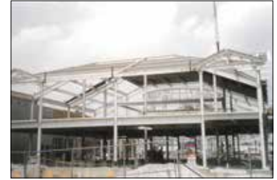
Village Hall, mid-construction, with the former building visible in the background to the left, and Green Meadow Shopping Center across the street.

Since its opening, the building and its grounds have seen several significant modifications, including the addition of the Russotto Fountain, Driscoll Catholic High School Hallway, installation of Covid-19 glass protective barriers, enhancements to the Village Green, a new Administration Department conference room, and the redesign of the Community Development Department offices. It is poised to serve the residents of Addison for decades to come.