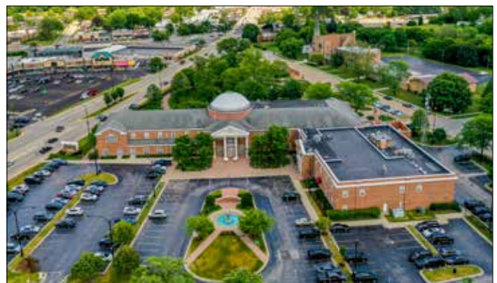
Addison Village Hall has continued to evolve since it opened in 2000, and even since this photo from 2020. Most recently, parking lot improvements, the expansion of the Village Green with Veterans Circle, and departmental renovations have kept the building a vital part of the community.