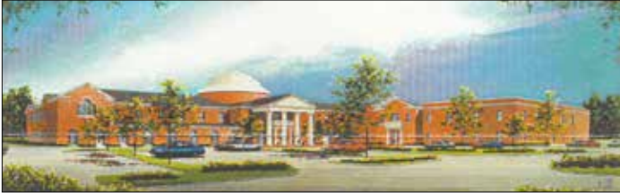
One of the original renderings of the new Village Hall and renovated Police Department, prepared by FGM Architects.

In 2025, Addison Village Hall will mark its 25th anniversary. This is the fourth and final part in a series, commemorating this important milestone by looking back at all the structures that have served as Village Hall.